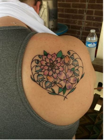
Happy family symbol images free download. What is a good symbol for family. Family symbol images. Download family love symbol images. Family symbol images download. Happy family symbol images. Symbols about family. Family love symbol images.